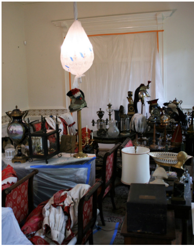
Front Napoleon Parlor looking into the rear. We will never see the rooms like this ever again ... at least, I hope not!