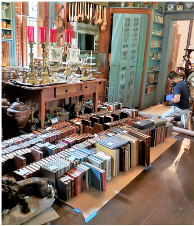
Books were temporarily stored everywhere, including the Kitchen.

We also had a few mishaps with the smoke alarms in the house. The painters were incredibly careful with their preparations in every room prior to doing any work, even covering the smoke alarms prior to spraying inside. However, the alarms are so sensitive they did go off a few times despite being covered. Imagine our faces when sirens started blaring in the house! This did provide a bit of good news: we now know the alarms work great.