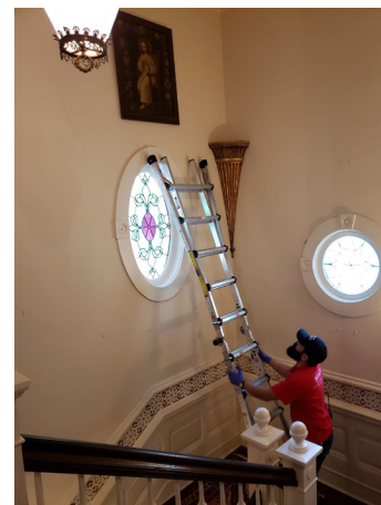
July 28th: we began the project by moving objects on the main staircase.

In 2017 we had completed a rewiring of the entire house and that project was intense, even though we only moved about a quarter of the objects in each room. The painting project, however, would require every single item be moved out of six areas: the Main Hall, Napoleon Parlors, Library, Dining Room, and Bar hallway. A couple of months prior to the project, we finally put together a plan for the movement of the collection.