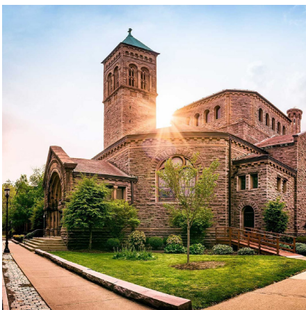
First Presbyterian Church of Wilkes-Barre (Wilkes-Barre, PA)

Please visit the National Fund for Sacred Places' website at https://fundforsacredplaces.org/ to learn more about the grantees and the program, eligibility, participants, and the value of sacred places in communities across the country.