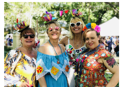
We're looking forward to seeing your creative headwear!

See the "Upcoming Programs Highlights" section of this newsletter for more information. We hope to see you there!