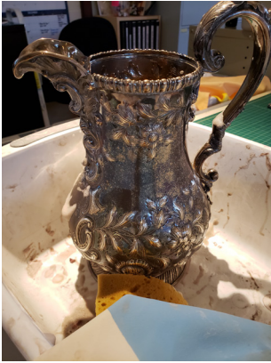
March 2022: silver pitcher before and after polishing.