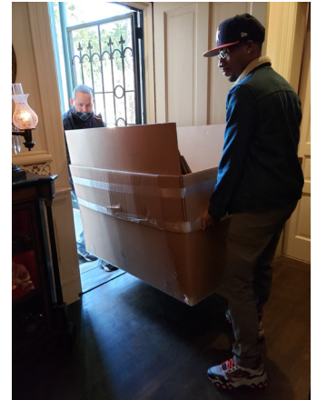
Bonners and Onderdonks displayed at National Trust headquarters being returned on March 9, 2022.

Also, if you have visited us recently, you may have noticed that we had some artwork missing. Those pieces, which were being displayed at National Trust headquarters in Washington, D.C., are now back at Villa Finale!