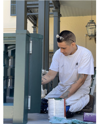
Spring 2021: painter working on the rear porch.