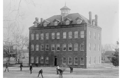
The Medical Dormitory located on the campus of Shaw University in Raleigh, North Carolina. Constructed in 1881, the building was razed in 1967.

These five Historically Black Colleges and Universities will receive technical assistance and funds for new Cultural Heritage Stewardship Plans, which in turn will empower them to protect, preserve, and leverage their historic campuses and landscapes. These academic institutions are symbols of African American pride and will continue to inspire and educate future generations. Congratulations to the recipients!