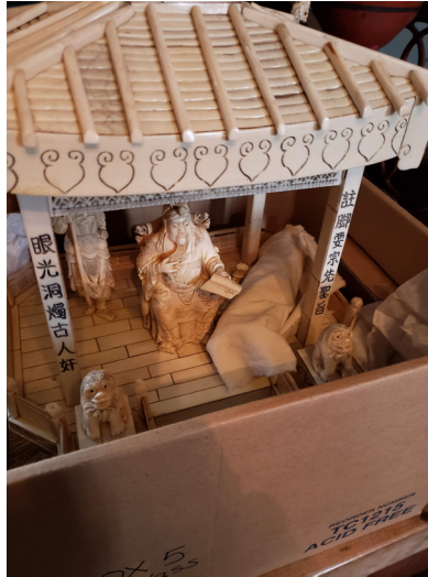
January 2022: ivory piece boxed and ready to be taken for cleaning and repairs.