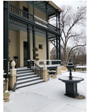
February 2021 at Villa Finale.

I recently found out firsthand as I sat in via a zoom meeting, hearing the stories from different site staff how extreme weather is affecting their historic sites around the country. This new reality really makes you think about future planning to preserve and protect not only our historic landscapes but the structures as well. Fortunately, we have not seen as extreme weather as other sites further north but, with your support, we will continue to preserve our site for future generations to experience and enjoy through sustainable practices.