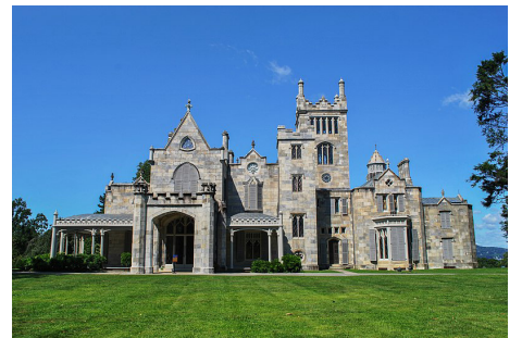
Lyndhurst in Tarrytown, New York.

Though Lyndhurst is no stranger to lights, cameras and action, this would prove to be the biggest production they've hosted to date. Visit www.savingplaces.org for behind-the-scenes photos and more details!